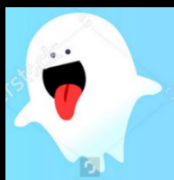
Ghost Colouring-in Competition