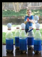
Nerf Ping Pong