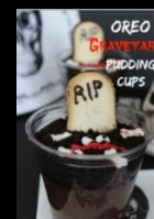
Oreo RIP Cups